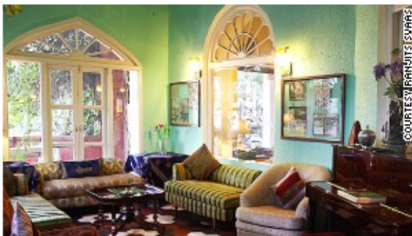
The main lounge at Svaasa is tastefully decorated with antique pieces and art from the family's personal collection.

From temples so gold they'll make your eyes water, to food you'll be longing for days after it hits your lips, Punjab is India at its colorful, lively best.